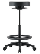
DRAFTING GAS LIFT Extended height